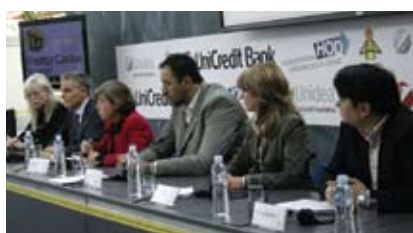
Left: Press conference of the Unidea Foundation Million Euro Donation for Serbia.