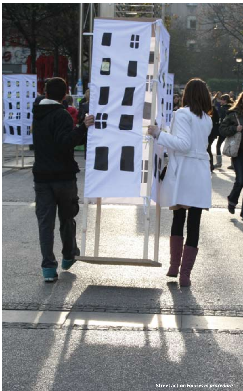
Street action Houses in procedure

We organised this public event at the Republic Square in Belgrade, with the aim to include wider public in the debate on social housing. The action "Flats in the Procedure" was realised in cooperation with